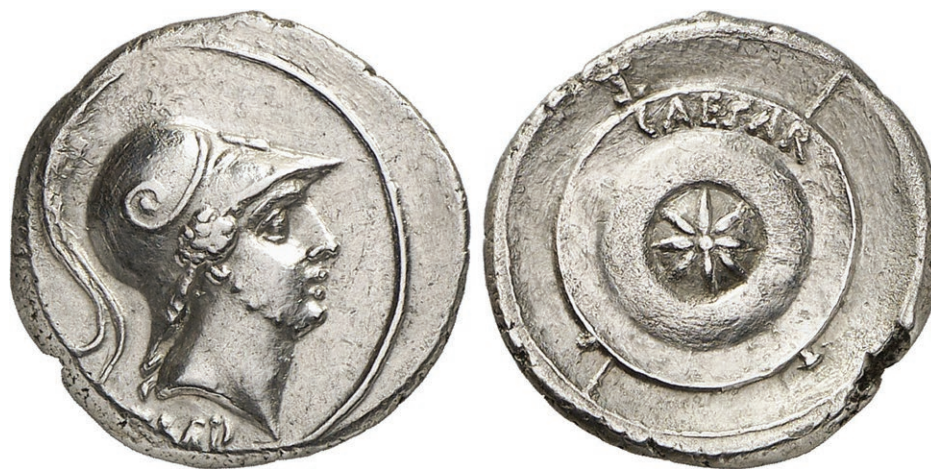
Fig. 3: RIC 274. (from: Gorny & Mosch Giessener Münzhandlung, Auction 240 [10. October 2016], 421)

Another important aspect was Octavian's personal bravery, intended to match that of Alexander. Although certain characteristics of different sieges in antiquity inevitably appear similar, it has been hypothesized that some details of the capture of Metulum may have resembled the assault